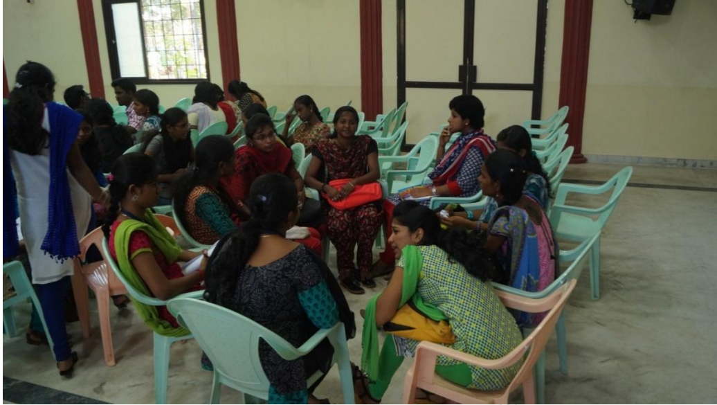
Group Discussion being organized as part of Placement Process.